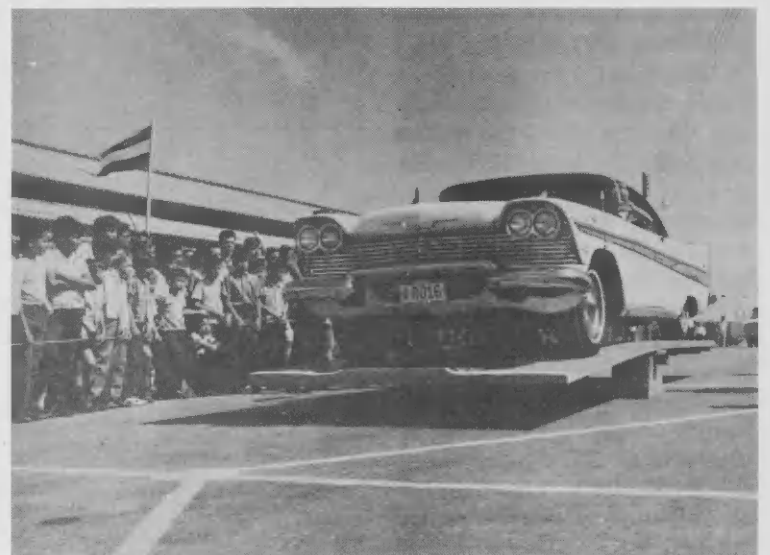
Car balancing - Balanzamento di auto.